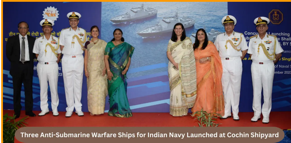
Three Anti-Submarine Warfare Ships for Indian Navy Launched at Cochin Shipyard

On 30th November 2023, the Cochin Shipyard marked a significant milestone with the simultaneous launch of the first three ships in a series of eight Anti-Submarine Warfare (ASW) shallow water crafts commissioned by the Indian Navy.