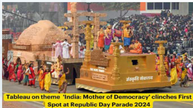
TABLEAU ON THEME 'INDIA: MOTHER OF DEMOCRACY' CLINCHES FIRST SPOT AT REPUBLIC DAY PARADE 2024

The Republic Day Parade 2024 witnessed a remarkable tableau that captured the essence of India as the 'Mother of Democracy.'