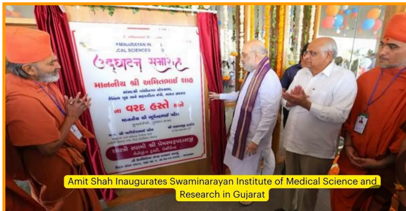
Amit Shah Inaugurates Swaminarayan Institute of Medical Science and Research in Gujarat

Union Home Minister Shri Amit Shah, along with Gujarat Chief Minister Shri Bhupendra Patel and other dignitaries, inaugurated the 'Swaminarayan Institute of Medical Science and Research' at the Shri Swaminarayan Vishwamangal Gurukul in Kalol, Gandhinagar, Gujarat.