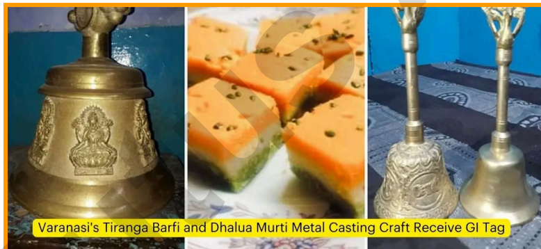
Varanasi's Tiranga Barfi and Dhalua Murti Metal Casting Craft Receive GI Tag

In a significant development, two iconic products from the historic city of Varanasi, Uttar Pradesh, have been granted the coveted Geographical Indication (GI) status. On April 16, 2024, the GI Registry Office based in Chennai announced that the Tiranga Barfi of Varanasi and the Dhalua Murti Metal Casting Craft have been included in the prestigious GI category.