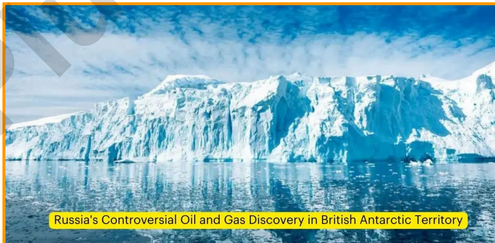
Russia's Controversial Oil and Gas Discovery in British Antarctic Territory