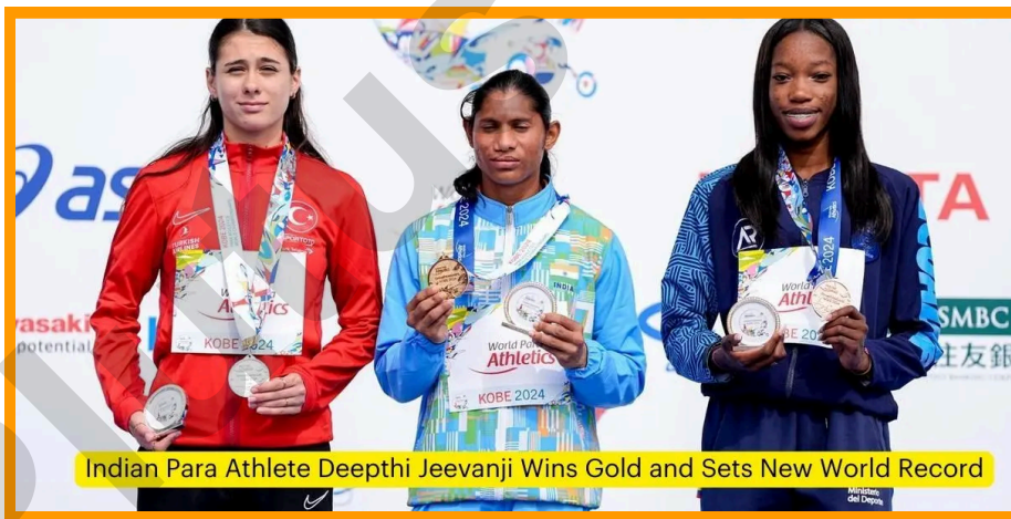
Indian Para Athlete Deepthi Jeevanji Wins Gold and Sets New World Record

Indian para-athlete Deepthi Jeevanji etched her name in history by winning the gold medal in the women's T20 400m event at the World Para Athletics Championships