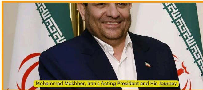
Mohammad Mokhber, Iran's Acting President and His Journey

Mohammad Mokhber, born on June 26, 1955, in Dezful, Iran, is a prominent figure in Iranian politics. He holds two doctoral degrees, one in international law and another in management, along with a master's degree in management.