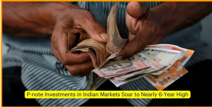
P-note Investments in Indian Markets Soar to Nearly 6-Year High

Investments through participatory notes (P-notes) in the Indian capital markets reached a staggering Rs 1.5 lakh crore at the end of February 2024, marking the highest level in nearly six years. This surge in P-note investments, encompassing Indian equity, debt, and hybrid securities, has been driven by the strong performance of the domestic economy.