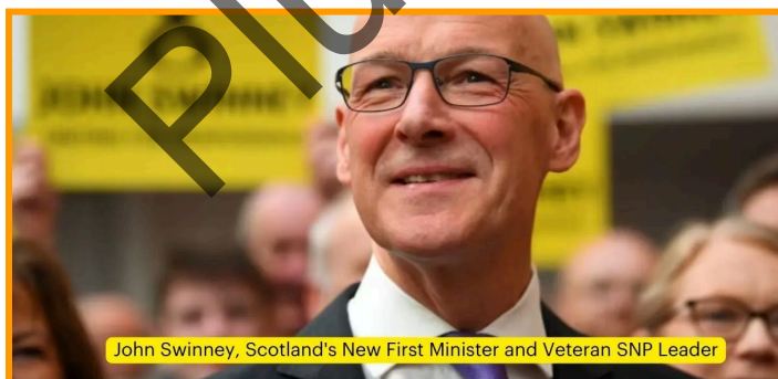
John Swinney, Scotland's New First Minister and Veteran SNP Leader