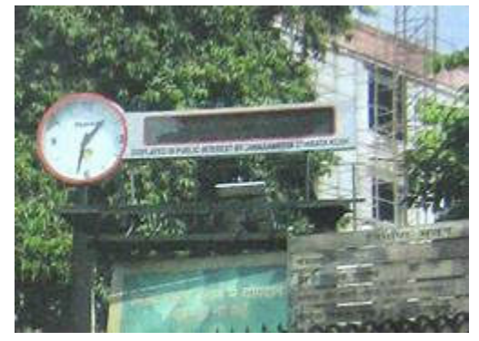
1. **Bengaluru Unveils First Digital Population Clock at ISEC**

- Bengaluru launched its first digital population clock at the Institute for Social and Economic Change (ISEC). This clock will provide real-time population estimates for Karnataka and India, helping citizens and policymakers stay informed.