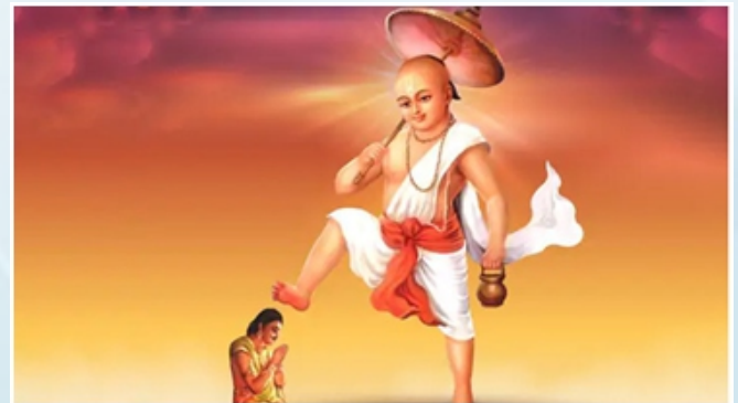
Karnataka celebrates Bali Padyami festival

Karnataka observes the Bali Padyami festival, commemorating the return of the Asura king Bali to Earth.